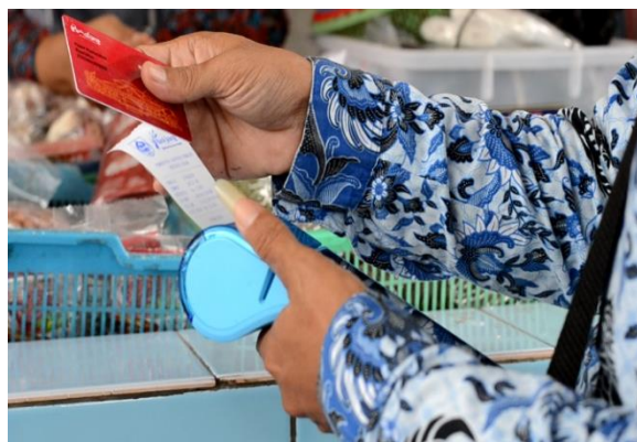
Figure 4.1 the form of card and E-Retribution Machine in Paduraksa Market (Researchers’ documentation)

“Whatever the policy and the program revitalize the traditional market has the strategy to implement and succeed the program. The strategy in revitalizing the traditional market is increasing the infrastructures of the market that aren’t appropriate yet as the healthy market. The characterizations of a healthy market are the maintained cleanliness of the market, the availability of garbage bins in every corner of the market, and the properly functioning drainage system. Besides, there is a loading and unloading separator of goods, there is the availability of adequate cleaning staff, and the market is protected from muddy and other dirty things. To solve these matters, we already prepare the supporting facilities for the market such as in Paduraksa Market that uses retribution systems by using electronic systems to avoid fraud. There is only one market that uses this electronic system, but gradually it will be implemented for other markets. This strategy is still ongoing although the program of revitalization is already done. It is caused by all facilities that need care and rejuvenation, so this program will continue for the convenience of the customers of the traditional market.”