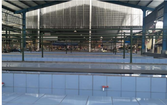
Figure 4.2 the place of sellers in Paduraksa Market based on the Standard of BSN (Researchers' documentation)

Other supporting resources in the program of revitalizing the traditional market are very needed to make the program successful. The utilization of supporting resources make the problems narrow in implementing the revitalization of the traditional market. So that, the strategy to utilize and support the supporting resources is needed to make a positive outcome. Dealing with it, the Head of Market Sector stated that;