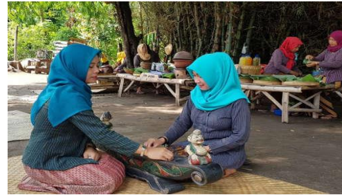
Fig. 12. Pasar Papringan Jambu Tourism village

This documentation can be explained that the nursery is an effort to conserve the environment through introduction of fruit seeds and grafting education. And the preservation of traditional culinary culture by presenting a natural market concept under the shady village atmosphere. Many aspects of creativity and contemporary culture now fall under the UNWTO (2018) definition of cultural tourism, which includes “arts and architecture, historical and cultural heritage, culinary heritage, literature, music, creative industries and the living cultures with their lifestyles, value systems, beliefs and traditions.” This suggests significant integration of the creative economy and cultural tourism. UNWTO research shows that 81% of National Tourism Administrations consider ‘contemporary culture and creativity’ (film, performing arts, design, fashion, new media, etc.) as part of cultural tourism.