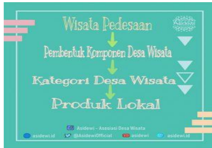
Fig. 6. Stages of Determining Local Products

attract tourist visits to the village location. Sustainable tourism development is meeting the needs of tourists today and protecting the potential of the village and increasing opportunities for the future. This encourages the management of owned resources so that they can meet economic, social and aesthetic needs while maintaining cultural integrity, important ecological processes, biodiversity and life support systems. UNEP (2002). [10] The following is the flow of rural tourism to the stage of being able to serve local products: