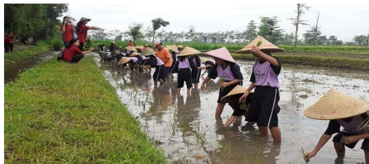
Fig. 4. Rice planting tour

Concrete steps that can be taken by tourist villages to increase the chances of visiting millennial tourists are the use of technology. Collectively, tourist villages can create a digital platform called the tourism village electronic application or E-Dewi. This application serves as a provider of information, receipt of payments, and online interaction with managers. This opportunity is supported by data on the amount of technology utilization from hootsuite.com, which states 7,593 billion total population, 4,021 internet users, 3,196 billion active social media users, 5,135 unique mobile users, and 2.958 billion active mobile social users. Internet users in Indonesia according to Kominfo in 2018 are ranked in the top 6 in the world until 2018. Other sources at apji.or.id mention 143.26M internet users out of 262M Indonesia's population. The Ministry of Tourism in 2018 argues that 63% of traveling activities are currently being searched for, ordered and sold online and 50% of online travel sales use more than one gadget, even more than 200 reviews about traveling per minute have been posted on TripAdvisor. Apart from promotional efforts and socialization through digitization, the importance of social networks. Building social networks and developing cooperation is an important and strategic agenda that must be well understood by village assistants. The following is a form of tourism promotion via Instagram :