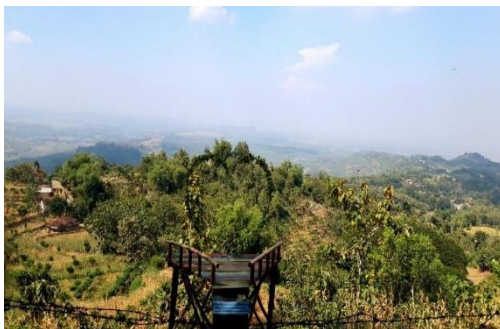
Fig. 9. Wisata Puncak Tapan Andongsari

Next, the village of Wisata Puncak Tapan Andongsari, Grabagan District, Tuban Regency, the tourism village was initiated to optimize the improvement of the village economy by utilizing empty land with all its limitations because the road access to this location is still a lot of damage and limited lighting, but pokdarwis succeeded in changing the top of the village. be an interesting vehicle [13] The following is the documentation of the peak tour of Wisata Puncak Tapan Andongsari: