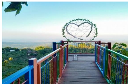
Fig. 10. Spot rides

Based on the exploration of guava tourism village, kutang tourism village and wind tapan tourism village, it can be concluded that: creative tourism as a creative economy that produces “knowledge-based creative activities that combine the needs of tourists by utilizing regional potential by utilizing technology, talent, or skills to produce rides and tourist attractions to experience creative experiences “OECD (2014) [14] Design decisions need to be based on user intentions and experiences and holistic approaches to problems and opportunities; combine imagination, creativity and science for effective innovation; and recognize that stories, especially of the users, are an important tool in the design process [15].