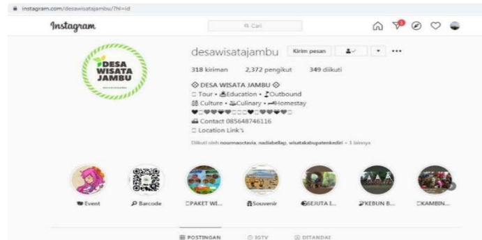
Fig. 5. Instagram account for Jambu tourism village