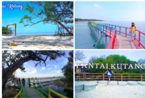
Fig. 7. Pantai Kutang