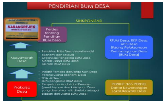
Fig.1. Bumdes establishment