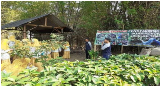
Fig. 11. Jambu Tourism village nursery

Beside the direct advantages, there are some indirect impacts that are received by community of the village related with village tourism development, such as transportation infrastructure improvement, development of utilities and facilities of health and sanitation, development of micro industry in the village, etc.[10]. The following is one of the benefits that can be felt, such as the ones we document below: