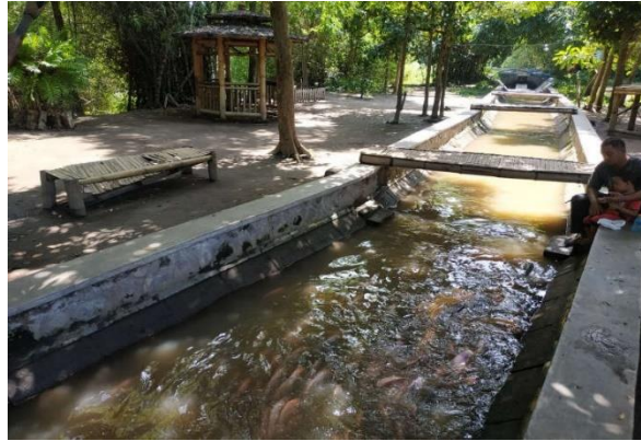
Fig. 3. One million fish tour