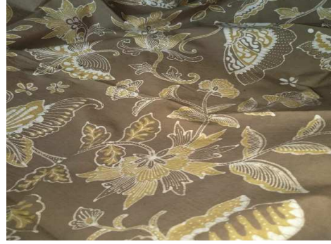
Picture 13. Natural Dyes made of Maclura wood and Manggo leaves