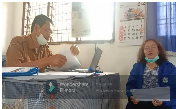
Fig. 1. Interview Alt Committee treasurer. Source: Djuni Posma Rouli, April 23, 2021.

The Legal Foundation. The legal basis for funds is from the Permendikbud committee number 75 of 2016 and Government Regulation number 66 of 2010 concerning the management and implementation of education. The school committee has a role and function 9 in Permendikbud number 75 of 2016.