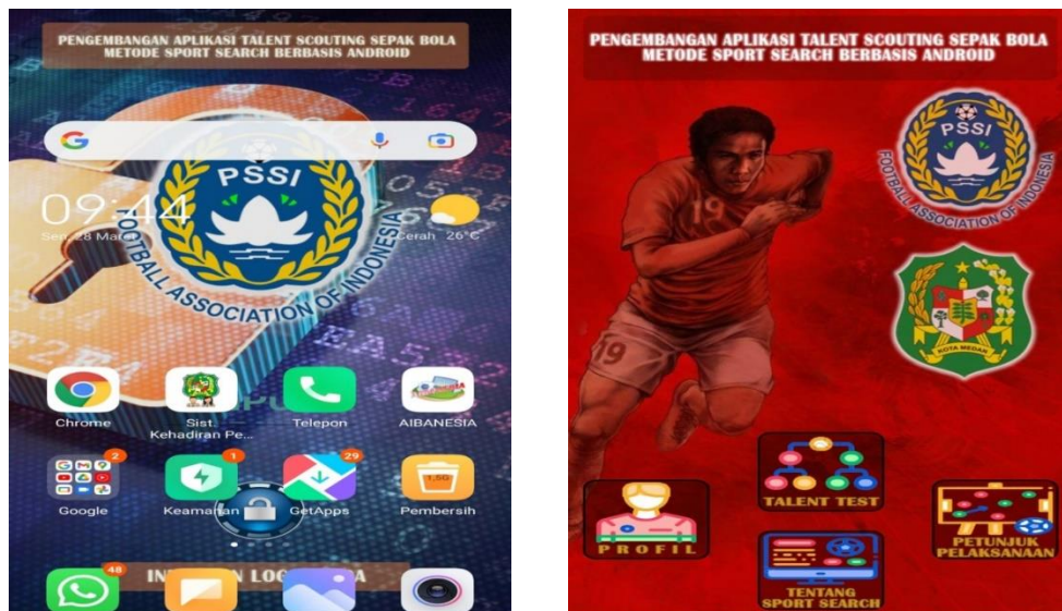
Fig 2. Display

The development of a product called AIBANESIA (Indonesian Talent Identification Application) based on Android as a tool for making product media. The following is a product display that researchers have successfully developed