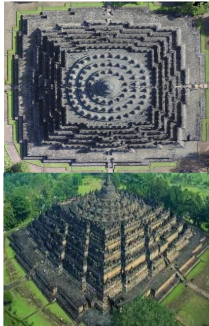
Fig. 3. Central borobudur architecture.

The concept of mathematical physics at Borobudur Temple is shown by the shape of the building structure resembling the concept of flat and spatial shapes in mathematics. The essence of Borobudur Temple is a stupa. When viewed from above, it is in the form of a large mandala pattern, which is an arrangement of patterns consisting of squares and concentric circles that symbolize the universe. The design concept of the Borobudur Temple can be related to Euclidean Geometry. The building structure of Borobudur Temple consists of two main forms, namely circle, and square [12].