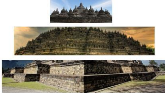
Fig. 1. Borobudur upper-middle base.

The structure of the Borobudur Temple consists of three parts: basic, middle, and top. The basic architecture is the basic identifier structure or as a dependent variant. With a 12 partitioned quadrilateral grid pattern which has similarities to the Turtle pattern [8].