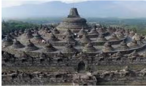
Fig. 2. Upper Borobudur Architecture.

Research on Borobudur Temple that has been carried out today focuses more on mathematical concepts as a result of designing buildings, measuring, making patterns, and how to relate these mathematical physics concepts to mathematics learning [11].