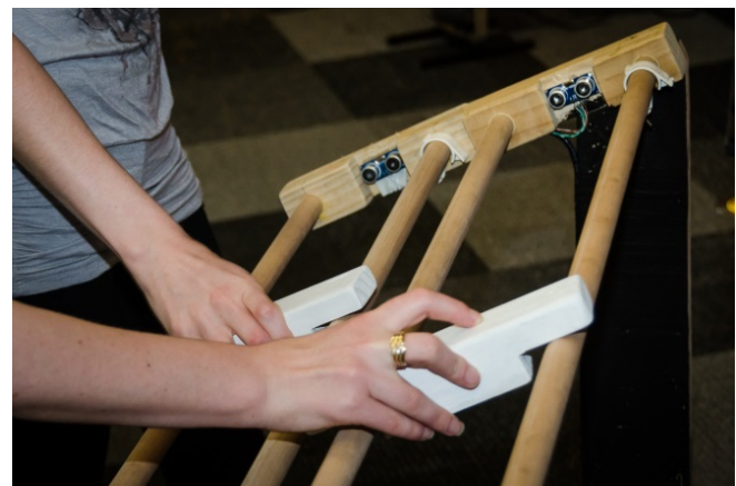
Figure 3. Interface for Space Octopus Mono

A full discussion of the games, the interfaces and the mediated play environment they produce would be overly detailed for the purpose of this article. A brief discussion of a number of the games will provide sufficient insight to the design intent of the developers in terms of how the games are intended to promote both gross physical movement and social interaction. These games are selected because the interfaces share a common design goal which was the creation of proximity between players. The decision to