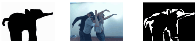
Figure 4. Game Shapes in Shadow Showdown

Figure 5 shows the game undergoing initial testing, and is composed of three parts. The first is the image that the players are attempting to fill, the second is the players themselves and the third is the difference map used to compute the score.