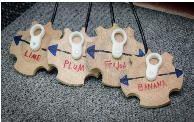
Figure 1. Interface for Fruit Racers

Figures 1-3 highlight a number of the interfaces developed for the games, with Figure 1 showing the interface for Double Shovel, Figure 2 showing the rotary encoders used in the game Fruit Racers, and Figure 3 showing the ultrasonic sensors and sliding rails used in Space Octopus Mono. This is a representative sample of the diverse range of interfaces used.