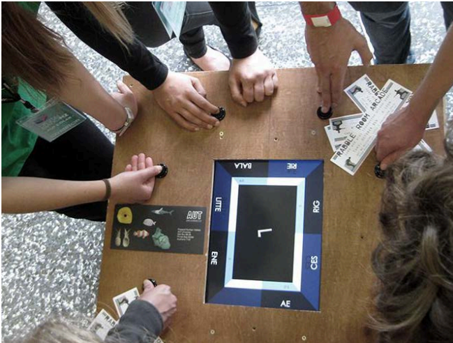
Figure 6. Word Wars