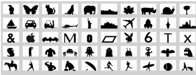
Figure 4. Game Shapes in Shadow Showdown

The development of Shadow Showdown [59] has been informed by the transformation of the game Twister in to three dimensional space. As a game, it is designed around whole body interaction and is intended to challenge boundaries of space and the body. The game focuses on interaction in real world space within two contexts facilitated by a Kinect. The two contexts are firstly the relationship between players and the screen, and secondly the rapport amongst players. Gameplay is casual and intended for a general audience. Players use their bodies to mimic and fill in shapes displayed on a screen. The silhouettes of players are also displayed on screen, converging with the shape. After 15 seconds, a snapshot is taken and correct silhouette coverage is awarded percentage points. Players can either participate in teams or alone, cooperatively or competitively. The different shapes embedded in the game are shown in Figure 4.