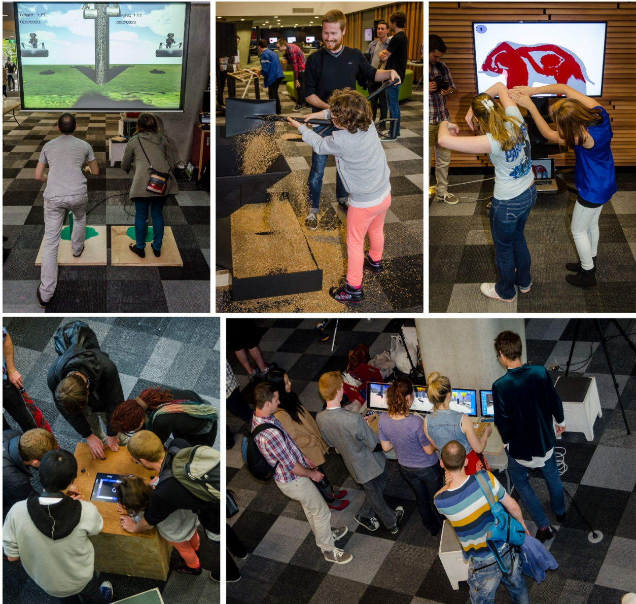
Figure 7. Gameplay at the Rabble Room Arcade

also positive, with over 100 attendees all of whom embraced the alternative interfaces and clearly identified with the makeshift and local spirit of the event.