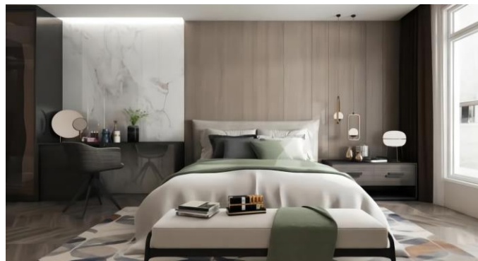
Figure 10. Bedroom Renderings

The bedroom design of this project should give priority to the three elements of the comfort of the bedroom "quiet, convenient, private." Any design should be based on the premise of these three points. The ground of the bedroom is the dark brown and the living room is dark brown. The dark itself will give a person a sense of stability and tranquility. The light brown curtains are unified with the overall tone and also add a romantic warmth to the whole space. Master bedroom and second bedroom are equipped with independent desks with practical equipment such as computers and storage boxes. The function is not reduced, so that the whole living space is more spacious and beautiful at the same time. Downlights are the main lighting in the bedroom, and there is no main light, so that the whole space is open and atmospheric. The integral design of the bedroom pursues the perfect unity of function and form, which is elegant and unique, concise and lively (Figure 10, Figure 11).