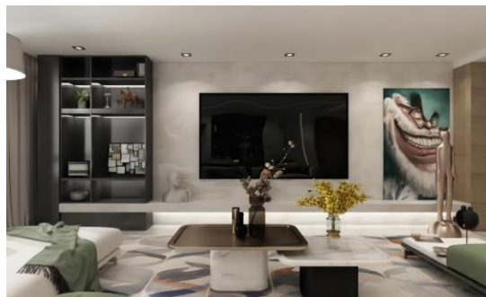
Figure 2. TV Background Wall Renderings