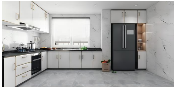
Figure 8. Kitchen Renderings

The kitchen design of this project is L-shaped, which can maximize the use of the operation space in the middle of the kitchen area, improving space utilization, and adequate storage space and kitchen mobile route are also in line with people's habits and needs. The ambry is made of white fireproof bake lacquer board, with black marble mesa, black and white match, giving golden handle and veneer. The metope and ground of the kitchen are made of marble tiles: the ground is 600 * 600 gray marble floor tile; the walls are 600 * 600 white marble wall tiles. The overall color is noble and elegant, which echoes the main colors of the living room, playing a role in the entire interior design harmony (Figure 8, Figure 9).