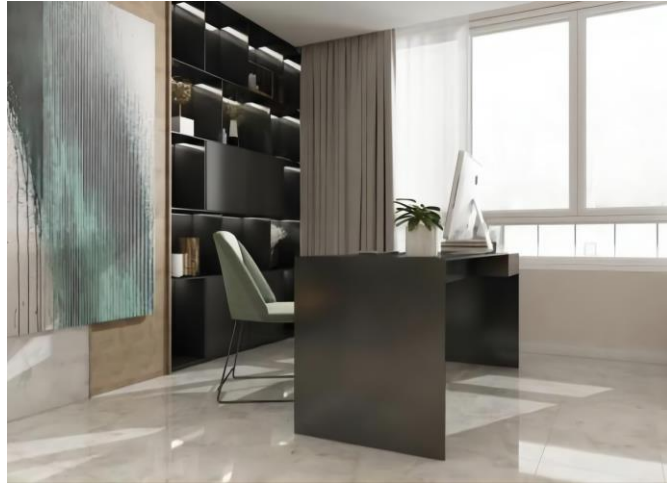
Figure 7. Study room effect picture