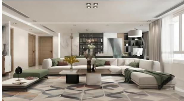
Figure 3. Living Room Renderings