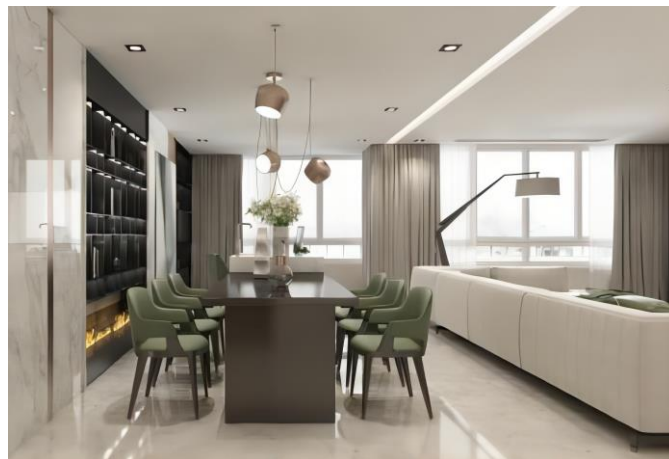
Figure 4. Restaurant renderings

The dining room and study of this project are designed in terms of activity space. The dining room adopts a space design without barriers, which is connected with the living room and study room to form a large shape space. This design allows many people to use the activity space, and walk around at will. In the design of the dining area, the table is far away from the kitchen and restroom, so a sink is set next to the table that can be used by many people to facilitate cleaning during the meal. The background wall of the restaurant adopts the same color as the dining table, and the metal luster is perfectly integrated into the overall design, creating a calm and deep feeling for the whole space. In this study, a fully open design was chosen, and the use of this kind of non-shelter design enables the owner to have more ventilation and wider lighting surface during use, improving the convenience of daily life (Figure 4, Figure 5).