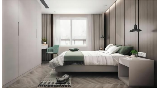
Figure 11. Bedroom Renderings