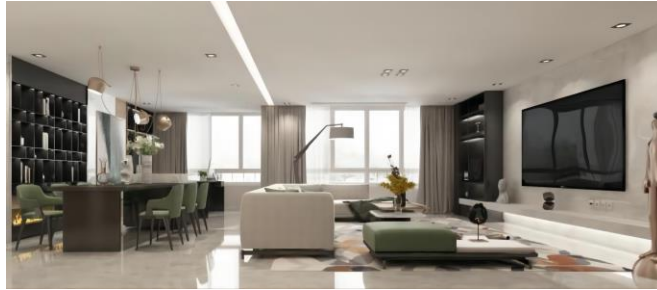
Figure 5. Guest Restaurant Renderings