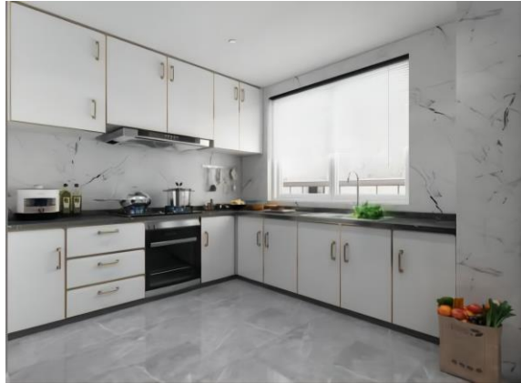
Figure 9. Kitchen Renderings