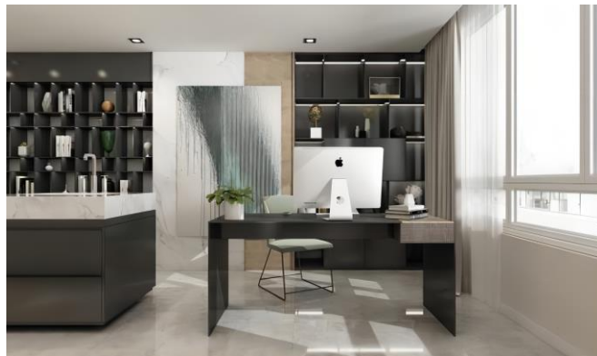
Figure 6. Study room effect picture

In the application of color, the study and the dining room use the same color of furniture, and the combination of brown and brown tables and chairs is used in the furniture of the two spaces, and such as gold metal chandeliers and accessories, etc. are used in the decoration. This design makes the two spaces more integral, and also echo the accessories in the living room. At the same time, the large area of gray application is contrasted, adding vitality (figure 6, figure 7).