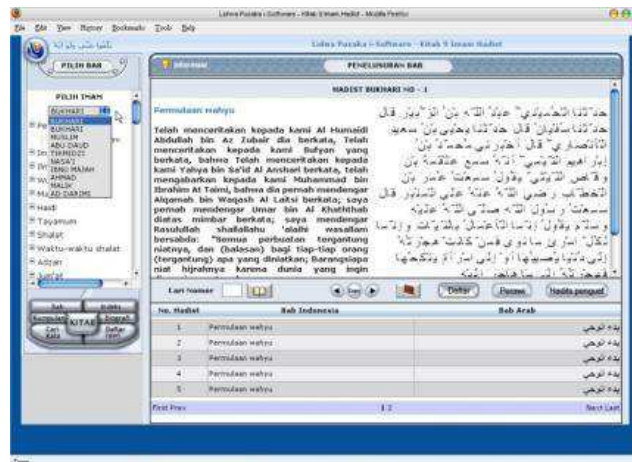
Figure 2. Search Menu Display

2) Use the search menu in order to search certain ḥadīth, the rawi or scholars who tale the ḥadīth, and book of ḥadīth collections which collected the ḥadīth. We can choose one of chapters of the collection of ḥadīth, such as the prayer, zakat , fasting etc. We can also use certain words relating to the list of rawi and its biography or index. You should put the cursor in the search field, then type the keyword that will be searched in Arabic or Indonesian language.