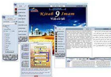
Figure 1. Kitab 9 Iman