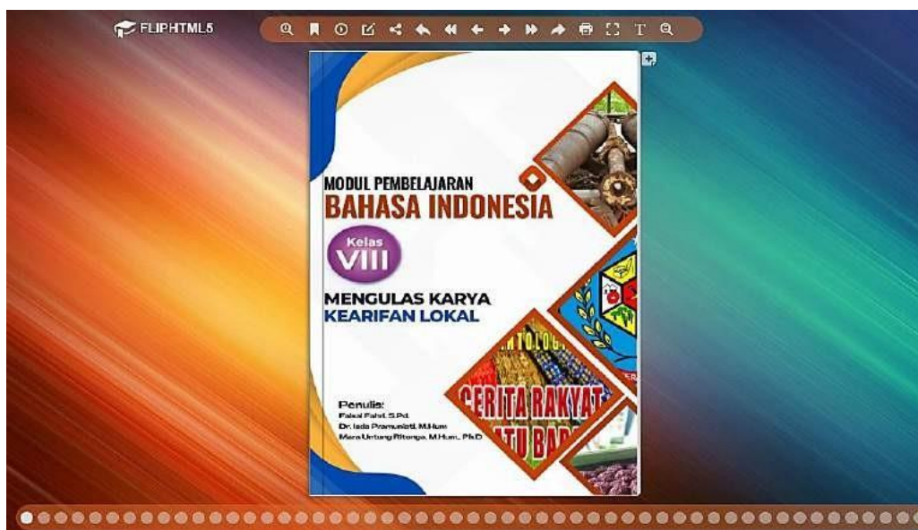
Figure 2. Product Results in the Form of E-Module Review Text Teaching Materials Based on The Local Wisdom of Batu Bara with the Help of FlipHTML5

The FlipHTML5 application or website is used to include video, audio, images, background sound, as well as practice questions and guessing/word games that are added to the review text teaching materials based on the local wisdom of Batu Bara with the help of FlipHTML5.