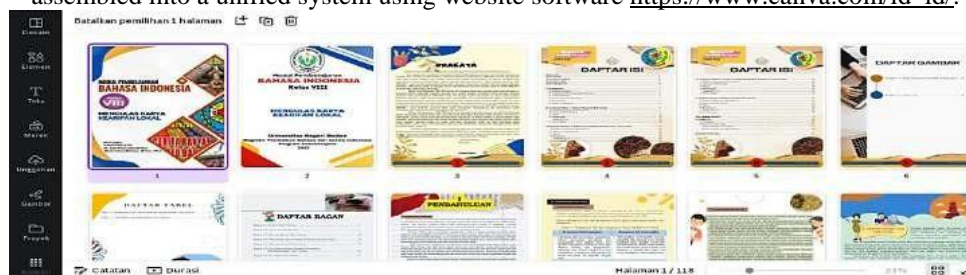
Figure 1. Preparation of Coal Local Wisdom-Based Review Text Material to be Made into E-Modules Using the Website https://www.canva.com/id_id/