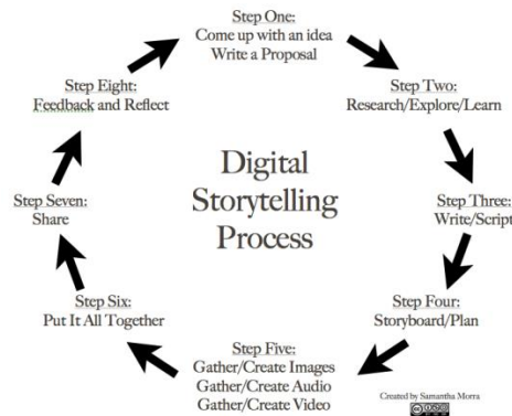
Picture 2. Digital Storytelling Process

understanding the content of the story because the presented display is in the form of audio-visual. On its implementation, digital storytelling uses some new technology or media. The use of sophisticated equipment, such as digital camera, headsets, video camera, crates (images, audio, video), put all together, share, and feedback. The following is a cycle of stages of digital storytelling process.