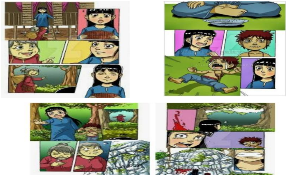
Pictures 2. Comics in digital, the works of Ashran (Malaysian Folk Tales)

Since the ancestral era, pantang larang is a thing which is considered as sacred. According to Aslan [33], everything which is considered sacred and having magical values is a culture of ancient Malaysian ethnic civilization. At this modern era, Malaysian people as a society still believes those pantang larang because they believe if they leave their ancestors' culture, it will cause a disaster on their life. Malay people believe that pantang larang for the sake of soul safety, activities, and occupations [30]. The following are media which are used to support the storytelling activities: