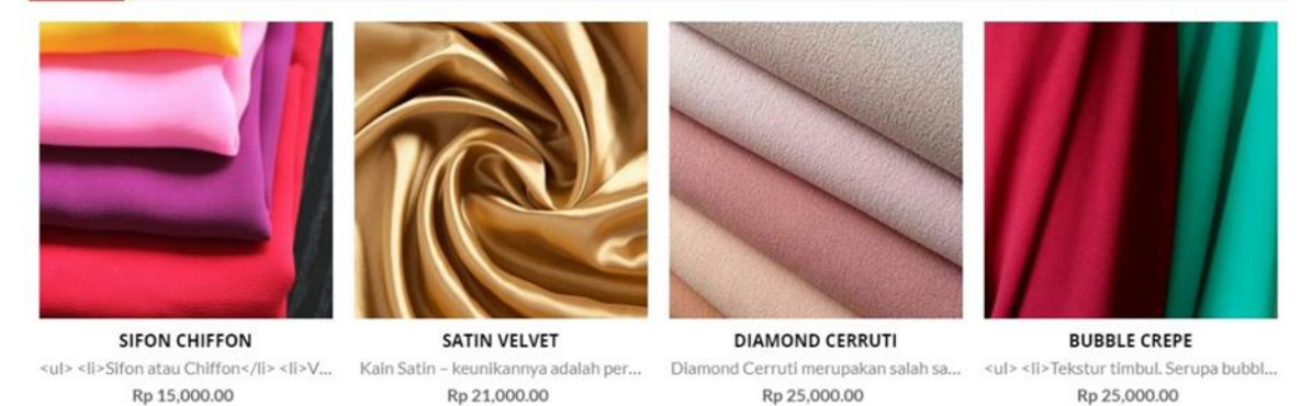
Fig. 2. Detail of fabric, this figure was adopted on 12 December 2018

Furthermore, in this third view, there is a definition of the type of fabric that is chosen by consumers and also displays the type of fabric where customers can enter into the basket to proceed into the payment stage. The following is an example of the Website in figure 3: