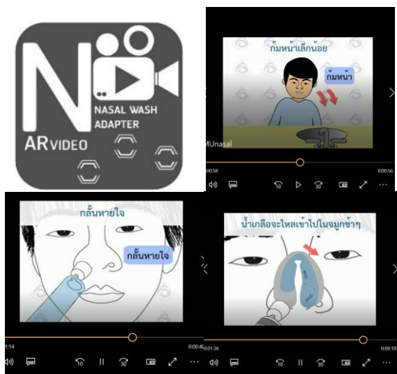
Figure 7. The nasal wash AR code for video

Results of data analysis on satisfaction assessment of users of AR applications on the android operating system, which use for presenting information through print media. These applications can be used with the smartphone. After that, the satisfaction questionnaires were delivered manually, The total number of questionnaires was 30, total 100% of respondents.