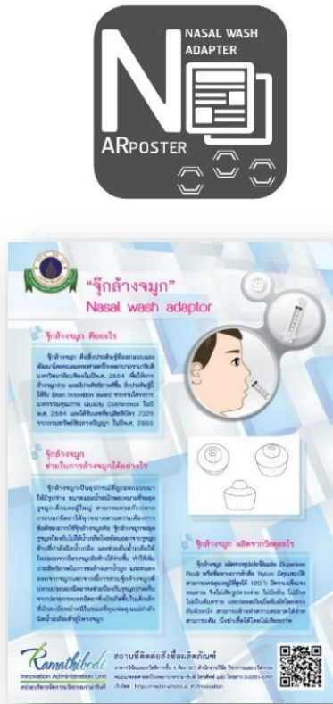
Figure 6. The nasal wash AR code for infographic poster