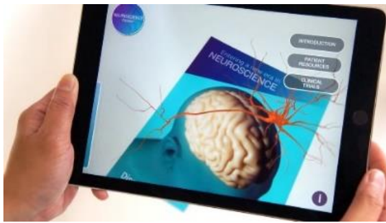
Figure 2. Augmented Reality (AR) Neuroscience Pipeline Teaser - Polygon Medical Animation