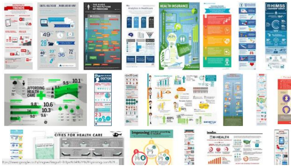
Figure 3. Infographics about Health Care available online