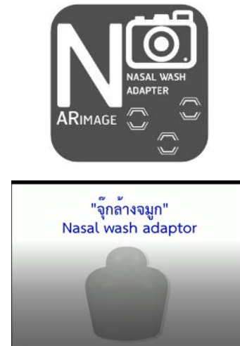
Figure 5. Example of the nasal wash AR code for image