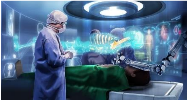
Figure 1. Future of Surgery: Augmented Reality and Surgical Navigation System.