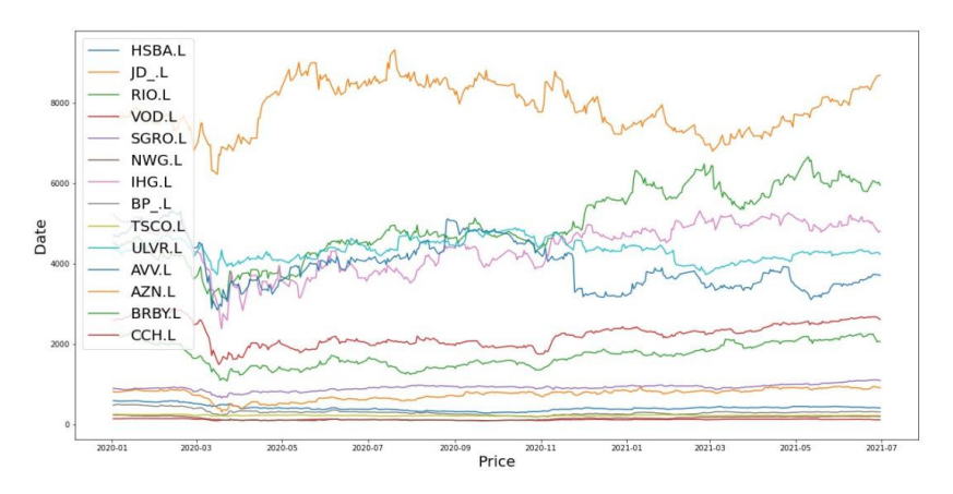
Figure 1. Stock prices of the considered assets from Jan.2020 to Jul.2021.