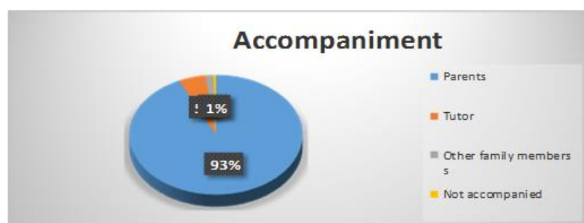
Fig. 1. Percentage of people accompanying students to study from home

The role of parents in supporting learning activities at home during the pandemic period so as to improve the quality of learning. The contribution of parents to education greatly affects the quality of children's learning. The contribution of parents to education must be carried out in a sustainable manner in motivating, providing direction and encouraging as well as providing the means to achieve ideals in educating children. Through activities to obtain information in conducting research, interview-taking activities were carried out by asking questions to informants regarding the role of parents in learning activities carried out during the Covid-19 pandemic. Researchers distributed questionnaires to people to find out the percentage of student assistance in learning at home. The percentage of the number of people who accompany students to study at home present at Figure 1.