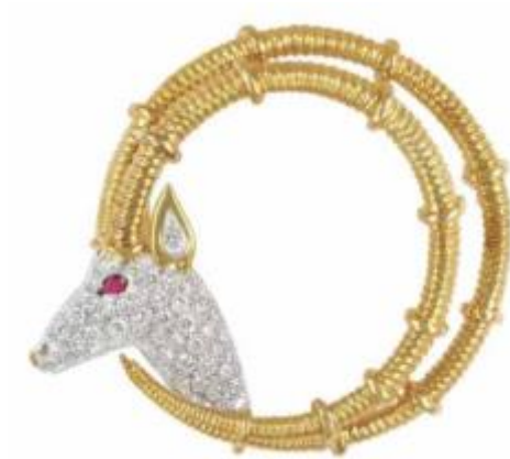
Fig. 2. k Golden zodiac sheep brooch

Zodiac jewelry made of k gold is rich in color and more exquisite Figure 2, and it is relatively cheap in precious metals and can adapt to a wider range of consumer groups. K gold jewelry is not only not like gold, but also not as easy to oxidation as silver jewelry, so it is more suitable for inlaid gems. [2]