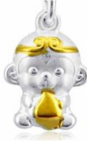
Fig. 3. Silver zodiac monkey pendant