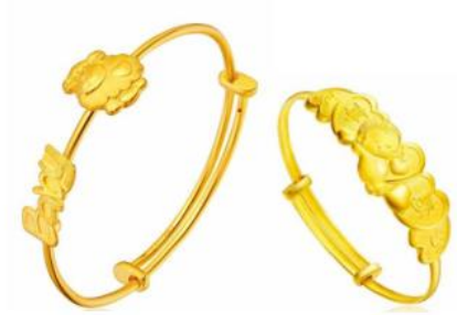
Fig. 1. Thousand feet golden zodiac hand said