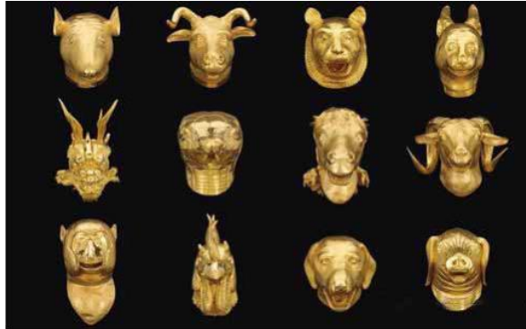
Fig. 4. Gold-plated sculpture "Twelve Chinese Zodiac animal head"