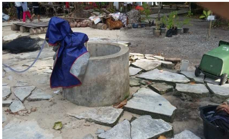
Fig 3. Condition of well to rinse

The picture above shows the beach environment that looks dirty. Besides that the facilities available are also far from good category. The toilet is provided in an open state. There is only well in an open state, sometimes surrounded by tarpaulin. So that when visitors want to clean the body of visitors is not comfortable with existing conditions.