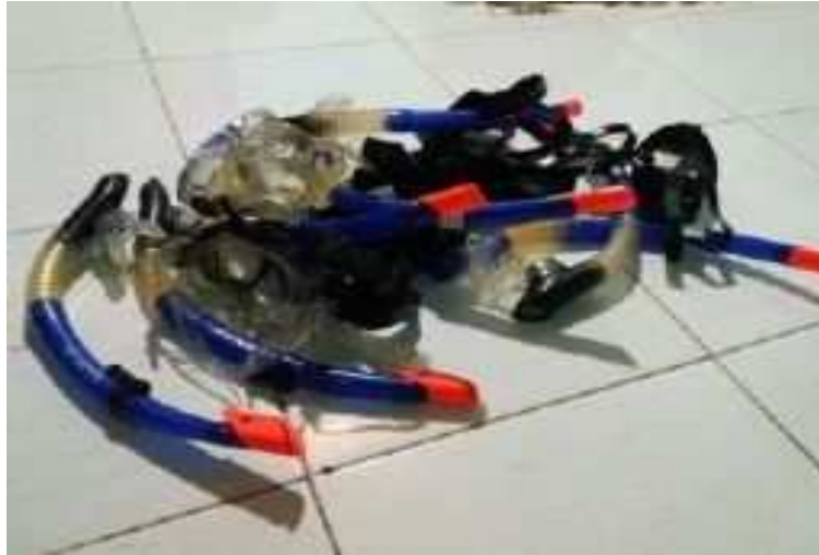
Fig 4. Snorkeling Equipment

Figure 4 above shows a number of snorkeling equipment, some of which are in poor condition. The color is worn and rubber equipment that is damaged is only replaced using ordinary rubber. This snorkeling equipment is rented by a travel agent if there are visitors who use tour packages to visit Pamutusan Snorkeling equipment provided by travel agents is not proportional to the number of visitors there. As a result the use of snorkeling equipment must be used interchangeably. This is not in accordance with the expectations of visitors, even though visitors have incurred a large enough cost to be able to travel to the island. Problems such as those described above are very hindering for the development of tourist attractions as stated by Suwanto [1]: "The main elements that must receive attention in order to support the development of tourism in tourist destinations, include: (1) Tourism Objects and Attractions (ODTW), (2) Tourism Infrastructure, (3) Tourism Facilities, (4) Governance (services, security, and comfort) (5) Community / Environment ".