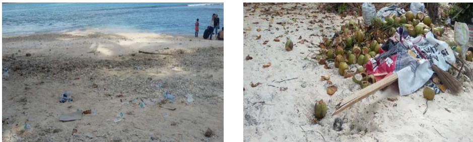
Fig 2. Dirty beach conditions with plastic waste and coconut waste

Ideally, visitors who come want a clean tourist environment. But in reality, based on preliminary observations of the current condition of the islands, the scattered areas are not properly considered by the management. There is a little rubbish. The waste is also left scattered around the coastal environment, so that the beauty of the beach is reduced. Like the picture 2 below: