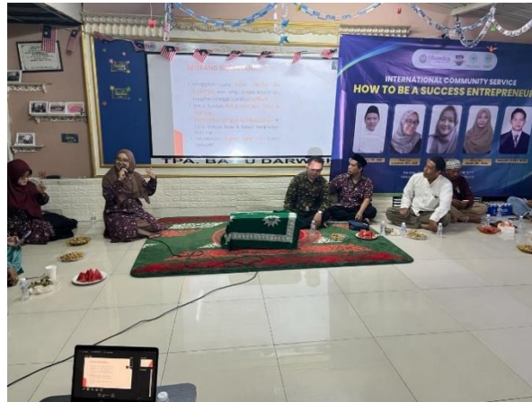
Figure 2. Presentation of Material from the Speaker

The next activity was for the MC to invite the speakers to present their material. The time given to present the material is 20 minutes. The material presented by the speakers related to why participants should become entrepreneurs, how to foster the entrepreneurial spirit, the types of entrepreneurs today, and how to utilize digital platforms to become entrepreneurs.