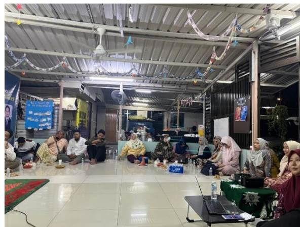
Figure 3. Participants listening to speaker material