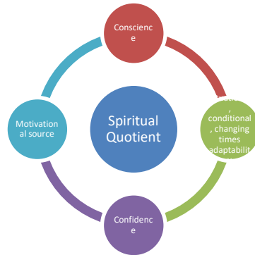
Fig. 1. Elements of spiritual quotient

Our awareness of good and evil is connected to our own actions (Andrew Wommack, 2018). Awareness is our conscience of the divine principles in holy life. Conscience in this case is where the individual can maintain holiness to not violate rules that are determined according to his beliefs. The emphasis of the researchers in this topic is the millennials who watched pornographic films. The technological developments have made possible information reception and internet access to become easy to use. It is therefore likely that millennials can easily access pornographic films. What is effect of watching porn? The impact received by the individual is that there is no more clarity of heart. This is what the focus of the researcher.