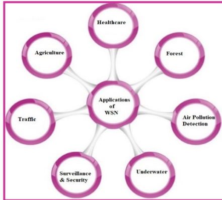
Figure 1. Applications of Wireless Sensor Networks

Comprises of a great number of lesser costs, multi-purpose sensor node which has been deployed for various purposes. In general, all the sensors are small in size and restricted in power and inbuilt with micro-controllers and radio transceivers [7]. The set of all sensor nodes are used for external functions where it senses and transmit the environmental data [8]. Real life environmental circumstances are being sensed, recorded, transformed into logical data by the sensor nodes in WSN which are further transferred, processed and used by users for many purposes. The design and quality of the sensor nodes not static for all scenarios. It differs in terms of design, robustness, transmission power, channel bandwidth, durability, etc, [9-11]. For example, sensor nodes in marine region are different from those placed in underground. Marine region sensors are well equipped and modelled which can withstand against the strikes such as moistures, water proof, etc. On the other side, underground sensors should be equipped with high transmission power in order to overcome the encircled noisy region. Sensor nodes can be coined as self-defensive, since it transfers alive status periodically thus helps the receiver side clients to monitor its durability [12-15].