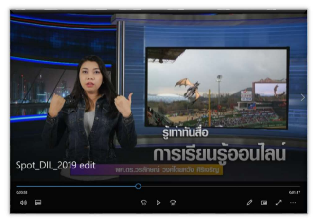
Figure 3. SMART MOOC, DIL literacy Module 3

Technology always has been used in working conditions in all locations and all the time. When communication is progressive and widespread, Interaction over the network makes interaction possible. A video conferencing system on the network system, is the trading system on the network. The nature of these operations allows users to expand the possibility of activities everywhere 24 hours. It spreads closer to the client and with advanced discipline, Service will spread even more at home. In the future, social work will spread until some jobs may sit at home or anywhere and at any time.