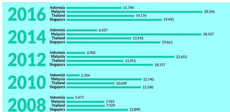
Fig. 1. Comparison of International Publication between Indonesia and Some Countries of ASEAN

This could be seen in the low output of R&D institutions in Indonesia about international publications. Based on SCImago data, throughout 1996-2016, the number of global indexed publications in Indonesia reached 54.146 publications. When compared to Singapore, Thailand and Malaysia, Indonesia's ranking was still far below the three ASEAN countries. In 2016, at the world level, Indonesia was ranked of 45 th for the number of published documents internationally. In the Asian region, Indonesia's position was ranked of 11 th , while at the ASEAN level It ranked of 4 th . In addition, the trend in the number of publication documents in Singapore, Thailand, Malaysia and Indonesia continued to increase. Starting in 2010, Malaysia shifted Singapore's position to 2 nd place. Regarding the published documents in Indonesia, the number increased to 46,41% (11.470 publications) compared to 7.834 publications in 2015. Despite the increase, this figure was still far compared to Singapore (19.992 publications) and Malaysia (28.546 publications). Looked at Figure 1 below: