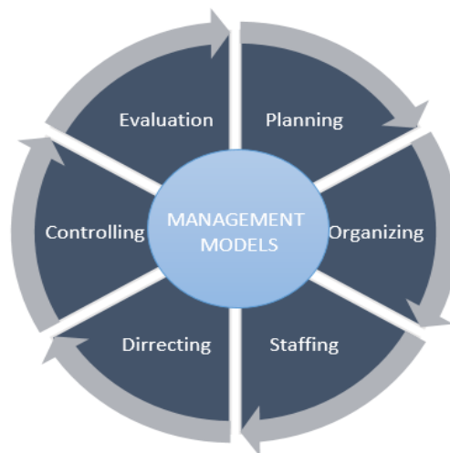
Fig. 1. Stages of Management Model of Waste Bank Margo Saras

For financing the operations of waste bank Margo Saras did not take advantage of this activity. The volunteers or the executive board of this waste bank Margo Saras just gives the benefits and advantages for the society that manages the waste.