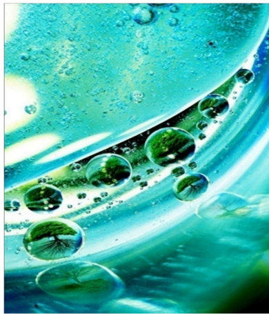
Fig 3. Photo of work 2 Title of Work: “Green the Earth”

The second flash is above the left of the aquarium with the direction of the position 316o aims to even out the light clearly in oil and water objects with the effect of light refraction. The position of the distance the direction of the light can change with the short distance. The closer the light to the object the harder the light produced, the more the farther away the light the softer the light produced.