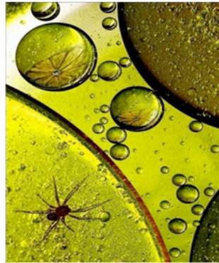
Fig 1. Photo of work 1 Title of Work: “Fresh Oranges”

commonly known fruit and is widely consumed by people. Citrus fruits are attractive to be used as refraction in terms of the texture of the citrus fruit itself. In this work there is a spider animal whose aim is that it is not monotonous to see in this work of oil and water exploration. The refractive effect of oil and water produces a distortion effect on the refractive medium, namely citrus, so that the refractive media which enters the oil and water becomes bubbling following the shape of the oil and water.