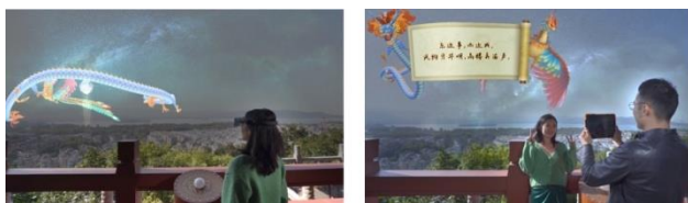
Fig. 3. Application of AR in Tourism-Scenic AR Pray[10]

Augmented Reality (an interactive and immersive flow of live experience, varying from Reality to Virtual Reality (VR)) is to superimpose ecologically (Gibson, 1977), computer-generated enhanced information (or affordance) into the real environment seen by the observer organically, in real time and dynamically[5]. According to Huishu(2019),when the observer moves in the real environment, the enhanced information also changes accordingly[6]. The enhanced information is just as if it exists in the real environment (Fig. 3). In other words, AR as in this work provides one basic structure for learning about Hainan Cultural and Creative Industries through play.