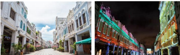
Fig. 7.The original scene of the old Arcade Street in Haikou and the AR light show effect

Two-way mode to enhance effectiveness. Enhanced display technology can be divided into positive and negative two-way enhancement mode. The positive enhancement mode is to supplement and expand the real environment with virtual information to enrich its experience environment and effect. The negative enhancement mode is to adopt the "disappear hidden" mode of material desalination or hiding the real environment in harmony with the real environment. Reduce the perception of the real environment and reduce the impact of disharmony factors on the display effect. Two-way enhancement mode of AR plays a positive role in the development of Hainan cultural resources. For example, the unique Nanyang architectural style of Haikou Arcade old street has become a typical representative of Haikou city style (Fig.9). The two-way enhancement mode of augmented reality can show the prosperity of and reduce the influence of surrounding modern buildings on its historical and cultural atmosphere.