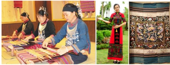
Fig. 1. Traditional Li Nationality Brocade form and works in Hainan, China