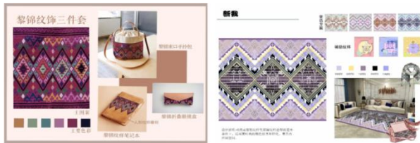
Fig. 2. The Creative Forms and Works of Li Jin Culture in China

Hainan province is the largest island in China, inflexed constantly by waves of immigrants of foreign nationalities since the Neolithicage. According to Zhenqing(2013), Hainan was mainly the ancestors of Li, Lingao people, the central plains people, immigrants from southeast and southwest of China and other regions.[2] Ling (2012) stated that after a long historical evolution and present in Marine culture, li and Miao folk custom, the Red Culture, Nanyang culture, the island culture is given priority to the characteristics of regional culture. [3] In a new era of high-quality development in China, Hainan is an important pivot of China's One Belt and One Road strategy, a free trade port, an island of educational innovation and an island of digital wisdom in China's national strategy. Refer also to Koleski (2017) [4]. It not only has a unique geographical advantage, but also has a special political status. At present, although Hainan has abundant cultural resources, the development of cultural and creative industries is relatively low, a complete industrial chain has not been formed, the integration of technology is insufficient, and the added value of products is low. The integration of modern technology represented by AR technology into Hainan's cultural and creative industries will help Hainan to transform into a digital and intelligent island, which has contemporary research significance.