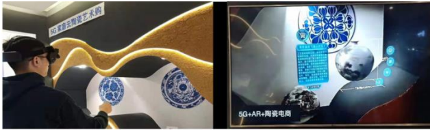
Fig. 8.AR Porcelain Display

Two-way mode to enhance effectiveness. Enhanced display technology can be divided into positive and negative two-way enhancement mode. The positive enhancement mode is to supplement and expand the real environment with virtual information to enrich its experience environment and effect. The negative enhancement mode is to adopt the "disappear hidden" mode of material desalination or hiding the real environment in harmony with the real environment. Reduce the perception of the real environment and reduce the impact of disharmony factors on the display effect. Two-way enhancement mode of AR plays a positive role in the development of Hainan cultural resources. For example, the unique Nanyang architectural style of Haikou Arcade old street has become a typical representative of Haikou city style (Fig.9). The two-way enhancement mode of augmented reality can show the prosperity of and reduce the influence of surrounding modern buildings on its historical and cultural atmosphere.