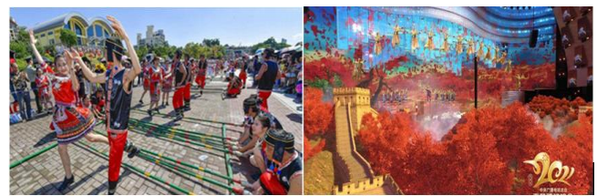
Fig. 8.Hainan Bamboo Pole Dance Show and AR Stage Scene[13]

personnel intervention factors, which will bring people a new viewing experience. By using the organic combination of AR and Hainan's characteristic cultural resources, we should explore cultural and creative products and cultural experience projects, select representative cultural heritage content innovation and development, promote the deep integration of Hainan's cultural and creative industry and science and technology. Finally form Hainan's cultural and creative industry development path with outstanding characteristics such as creative product development and sales, cultural project development and experience, non-posthumous cultural heritage, and science and technology promotion.