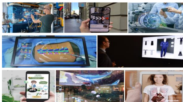
Fig. 5. AR Application Examples

At phase 1, the interactive sensor which is Kinect was used and set. The software used in this project called Touch designer. Before this software could be used with the Kinect, it has to be enabled and test. Kinect sensors need to be tested to make sure that their sensor functioning well (refer Fig. 1). During the testing, the calibration needs to be performed. The calibration of the Kinect sensor needs to be tested with the human body part such as the hand, neck, shoulder, and leg. To merge the sensor with the visual, the setup needs to be performed. The setup involves by activating the Kinect calibration with the value of x, y, and z. When the calibration value appears and is verified successfully, the next phases could be started.