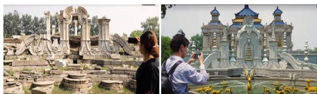
Fig. 7. AR Historic Building Restoration[12]

AR integrates Hainan's cultural resources potentially in the following manners. On the one hand, it can quickly identify Hainan's local cultural resources, save users' time and shorten the space distance. On the other hand, it enables through the virtual screen AR glasses, present the dynamic scene, all kinds of cultural and historical past through video, images reappear with rich digital media display of historical context, such as cultural connotation, the greatest degree of let users experience the rich cultural resources in Hainan and the historical background, to deepen the user understanding of Hainan, for the publicity and promotion of history and culture in Hainan play a positive role. Fig. 7 demonstrated AR restoration scene of the ancient Chinese Old Summer Palace.