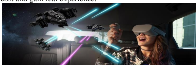
Fig. 4. VR Experience Form and Scene Construction[11]

Traditional VR is dedicated to fully immersing users in the computer-generated virtual world, which requires accurate modelling of the environment and a huge amount of work(Fig. 4). AR to eliminate the modelling for the environment, the core idea is: in the real world fusion computer-generated virtual objects, and make the virtual objects and reality of the world as an organic whole, enhances the user the perception and understanding of the real world, and when the camera motion, virtual objects can be synchronous tracking real environment, real-time registration (Fig. 5).The advantages and characteristics of AR enable it to be applied in many fields such as tourism, entertainment, education, games, museums, clothing, art, exhibition sales, medicine, cultural and creative gifts, and others. See also current works of Asadzadeh (2021)[7]. The application of AR in cultural and creative industries can improve the upgrading of manufacturing industry, speed up commercial publicity and marketing (Fig. 6), save time and cost and gain real experience.