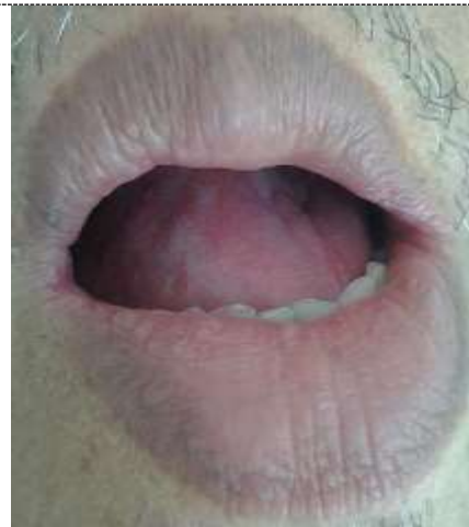
Figure 3. Billateral angular cheilitis