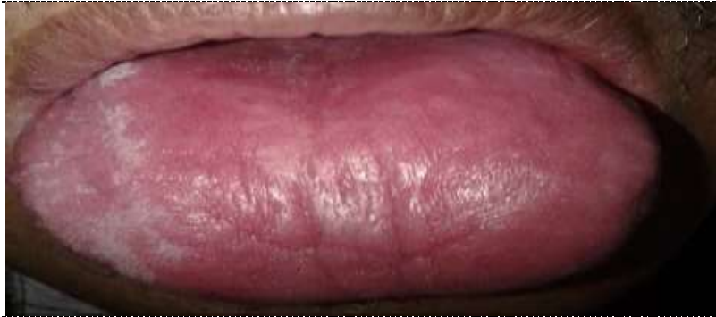
Figure 1. Papila filiformis and fungiformis atrophy on the dorsum of tongue