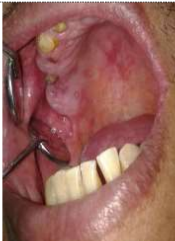
Figure 2. Candidiasis on mucocuccal surface.