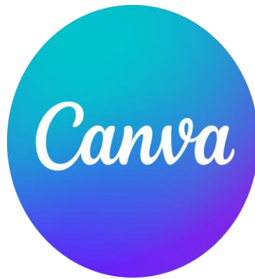
Fig.6 The Applivation Uses Canva AI