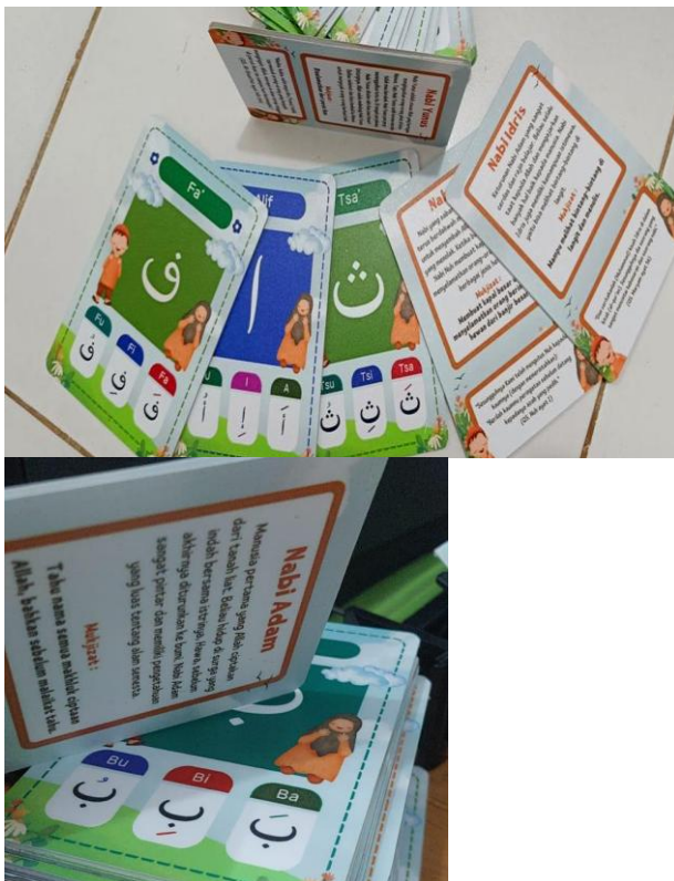
Fig.7. Preview The Entire Flashcard