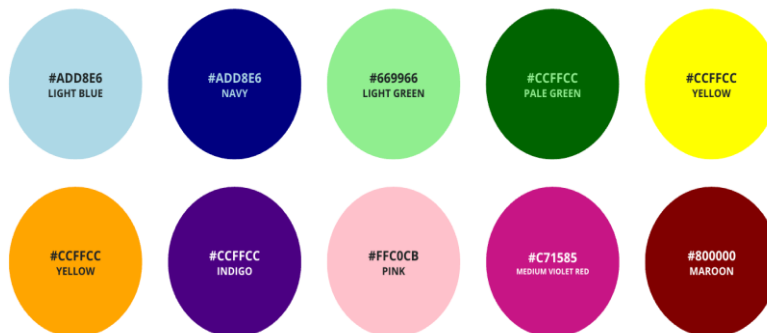
Fig.3. Color Selection

The colors in the flashcard letters are taken from the basic colors yellow, red, green, navy blue (cyan), magenta and orange.