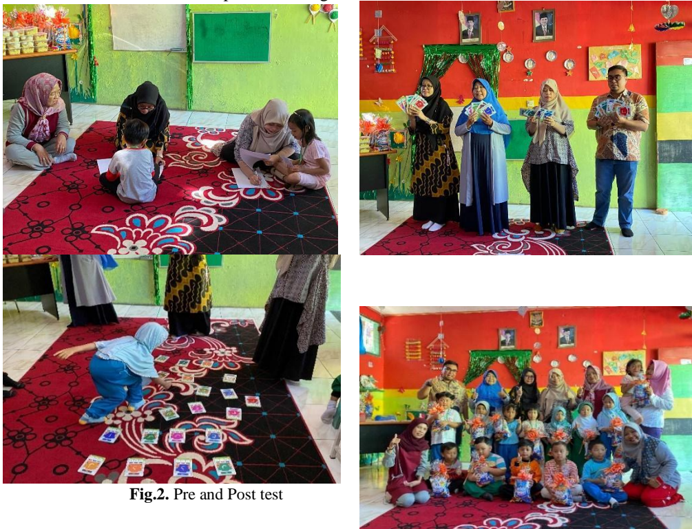
Fig.2. Pre and Post test

Based on the results of the pretest and posttest scores carried out on 13 students at Ilham Inspirasi Kindergarten. The pretest score is 520 which is a percentage of 40% of the results obtained from direct interviews with students at Ilham Inspirasi Kindergarten. After playing the games to determine the ability to recognize hijaiyah letters using flashcard media, the posttest results were 1120, which resulted in a significant increase with a percentage value of 86.1%. Hijaiyah letter flashcard media test results students at Ilham Inspirasi Kindergarten is very optimal in its application, which means it really helps teachers in teaching/introducing hijaiyah letters to students at Ilham Inspirasi Kindergarten.