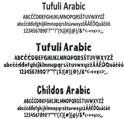
Fig.4. Font Selection