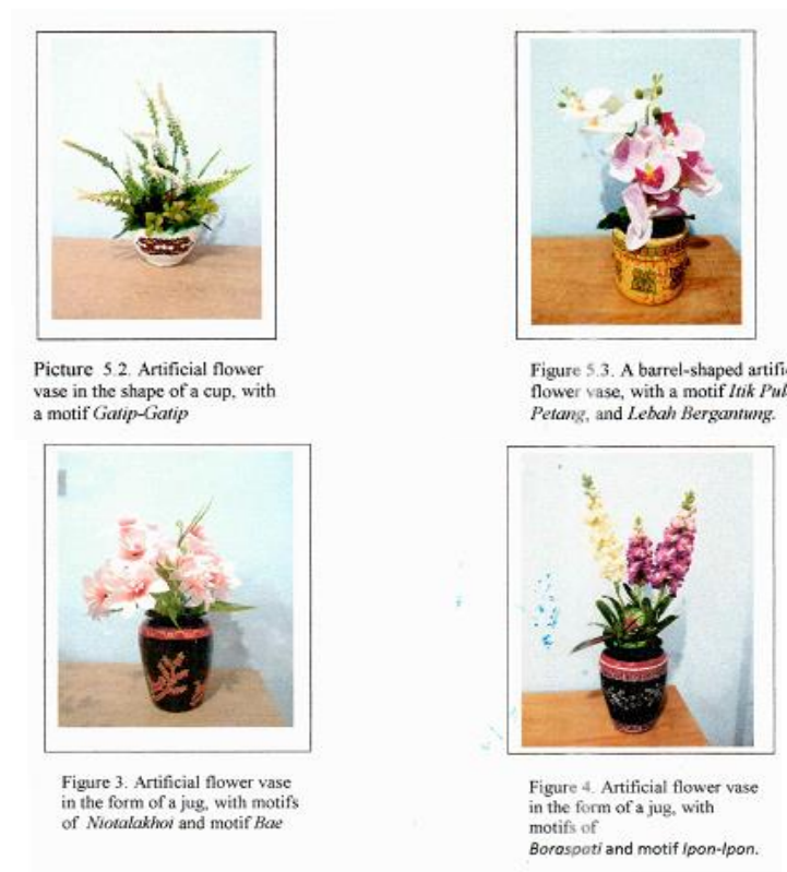
Fig. 3. Flower Vase Decoration Painting Technique

The application of stickers on artificial flower vases can be seen in the following image.