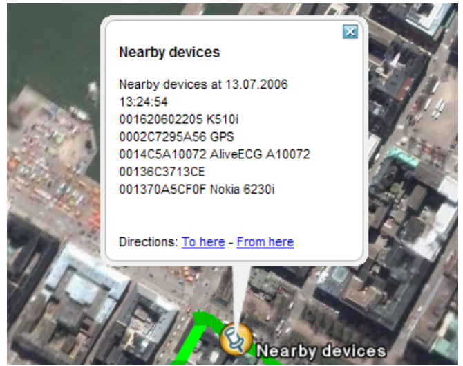
Figure 4: Using Google Earth to visualize (a) movements of the user and (b) Bluetooth proximity information