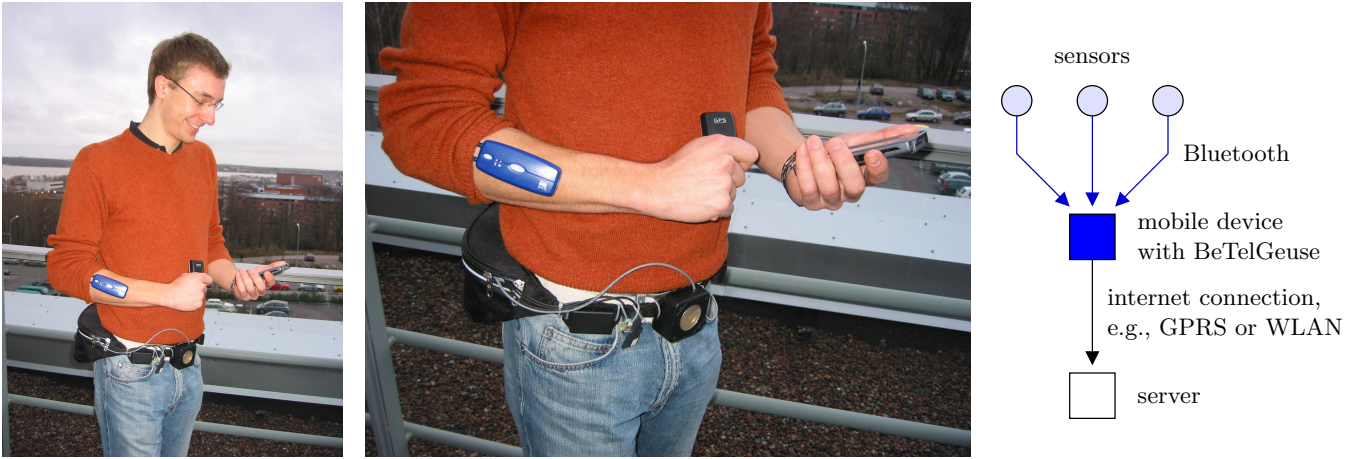
Figure 1: Using BeTelGeuse. Our subject carries a PDA device which runs BeTelGeuse. BeTelGeuse gathers data from the following Bluetooth devices: a GPS device (in the right hand), Alive Heart Monitor (attached to the right arm) and I-CubeX sensor system (on the waist, from left to right: the controller and an orientation sensor in the bag; a 3D acceleration sensor, an ambient light sensor, a temperature and humidity sensor, and an ultrasound distance sensor attached to the belt). See Table 1 for more information on the sensors.