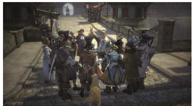
Figure 2. Screenshot of Fable 2. The dynamic character development has a central significance for the ethical game system. In addition to age, diet, and physical activity, moral behaviour also affect the look and appearance of the character (adapted from [1])

Each of these parameters can be used for determining the structure of the controls or as measurement parameters. The individual objectives of a SMG have to determine how these factors are to be instantiated.