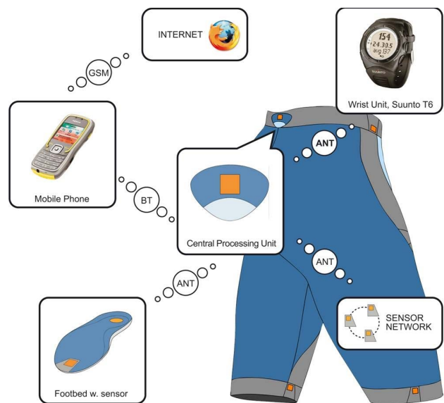
Figure 1. Garment-integrated measurement system for hip replacement patients, consisting of a wireless sensor network for posture measurement, a wireless load sensor in the insole (footbed) and a central control and processing unit placed in the waist area. The user interface is provided by a wireless connection to a wrist-top computer and a mobile device. The sensors are connected to the control unit by ANT wireless personal network, which is also utilized by the wrist unit. Bluetooth link provides a wireless connection to a mobile device or a PC.

The integration of the sensor nodes to the garment is achieved by placing the electronics on top of the fabric and casting them into soft polyurethane. The process forms a flexible textile-integrated casing for the sensor nodes, which brings a notable advantage to regular solid casing in terms of wearing comfort and visual appearance. In addition to being a factor of comfort and aesthetics, the polyurethane casing provides mechanical and chemical protection to the electronics.