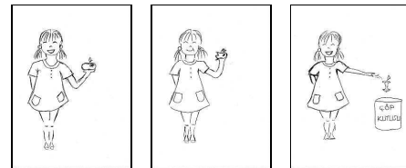
Figure 3. The three phases of an apple-eating event.

When the Turkish equivalents of these sentences are given as input to our system, the pictures shown in Fig. 3 will be generated in the left to right order: