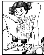
Figure 1. The image matching the Turkish equivalent of a sentence like ‘the child is reading the newspaper’.

It is noteworthy that the software is flexible enough to map the same image to all more or less paraphrasable expressions. When the situation above is encoded with different grammatical mechanisms, such as using there-insertion sentences (e.g. there is a child reading a newspaper) or relative-clauses (e.g. a child who is reading a newspaper is sitting down), L2I will be capable of detecting that the same content is encoded and will map the sentences to the same image. This flexibility is gained through a Natural Language Processing Engine which we have developed in order to extract the semantic content of Turkish sentences in tandem with their grammatical analysis. Fig. 2 shows the interaction of this and other components of the module of L2I responsible for sentence-to-image mapping.