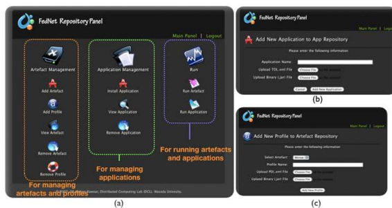
Figure 2: Snapshots of GUI Tool (a) Main Panel, (b) Installing Application (c) Adding Profile

guidelines so that the installation is successful. Each of the artefacts in our approach has a proxy component that represents the artefact digitally. This artefact proxy is disseminated as a generic binary. The artefact profiles implementing the augmented features are self-contained plug-ins that can be installed atop the generic binary. Applications are also released in executable binaries in our approach. These binaries can be installed by the end users just like any other executable softwares (i.e. double clicking the executable, and following the on-screen instructions). However, in our approach these installation mechanisms must reside within the FedNet environment, so that FedNet can provide the spontaneous federation among the applications and the artefacts. Since, in a smart object system, one application can use multiple smart objects, one important deployment task is to associate an application with one or multiple smart objects. The final end user task is controlling (running and stopping) a smart object system. To support these tasks we have developed a deployment tools for end users. The basic functionalities of the tool are as follows: