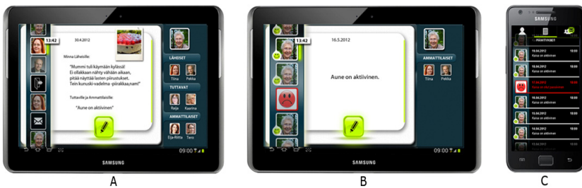
Fig. 1. Screenshots of the user interface; a) Target, b) Relatives and c) Professionals.

The Comcare has three different modes for monitoring activity of an elderly person; normal, enhanced, and continuous monitoring. Normal monitoring checks and forwards updates and sensor inputs once per day, while enhanced monitoring does the same four times a day (6-hour intervals). Continuous monitoring forwards all events realtime to the followers.