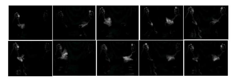
Fig. 2. A group of behavioural mimicry extracted from consecutive sets of frames (frame 92, 96, 98, 102, 103, 105, 108, 113, 120, and 123) of a recording in our database

The figure illustrates hand gesture mimicry behavior. This behavior is visualized by presenting the results of motion intensity calculation for hands movement. Motion cycle images are calculated by AMI in several successive frames for each annotated mimicry behavior in our data.