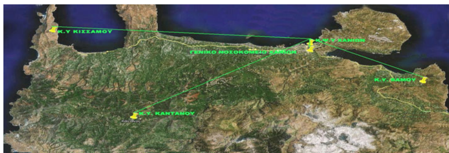
Fig. 2. Map of Chania Prefecture showing the locations where the pilot is in operation

surgeries in Vamos, Kasteli and Kandanos respectively in order to monitor the progress of their patients.