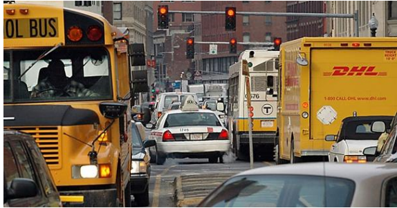
Fig. 1. AVCs would enable a local and effective scheduling of traffic lights in order to maximize traffic flow in all directions and mitigate the potential of deadlocks (Courtesy of Christian Science Monitor).

Consider for example, a city block where a traffic-related event (e.g. an accident) has occurred and where, as a consequence, a large number of vehicles are co-located. Once the traffic event has been cleared, relying on the existing scheduling of the traffic lights will not help dissipate the huge traffic backlog in an efficient way. We envision a solution to this problem where the vehicles themselves will pool their