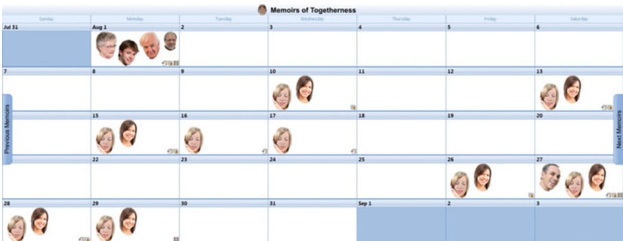
Fig. 2. Example of possible visualisation. Different socially connected people are automatically mapped on per day basis into personal memoirs of togetherness.

We were used the fixed confidence threshold equals to 50% of subjective confidence, which is higher than the worst confidence for solitary events. This has the effect of minimising false detection of social events, though the application of dynamic threshold selection can further increase the total performance. The performance of shorter subsegments is lower due the real world variability of the data (noise, reverberation, non-stationarity, etc).