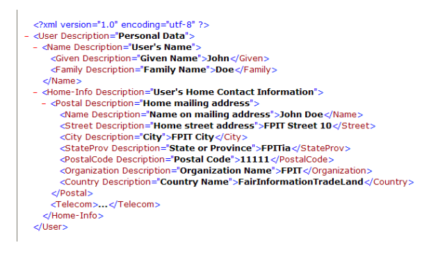
Fig. 1. Personal Information in FPIT

Personal Information can be represented in an XML schema like the one shown in Figure 1. This representation is simple and efficient enough to suit the needs of FPIT. Personal information is organized hierarchically in a number of categories, each of which can contain appropriate subcategories. This scheme can be expanded according to the implementation and usage needs of FPIT.