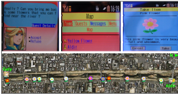
Fig. 3. The “River of Flowers” quest

The “River of Flowers” quest is of the second type described in section 2. After collecting a number of flowers, the player meets another NPC, who informs the player of the status of quest completion. “River of Flowers” is a single-player quest. It implicitly requires the player to walk or ride a bicycle, in order to collect virtual flowers. While this quest is primarily a demonstration of the MEP and inTrack platforms, it also illustrates the point that the gaming experience gains the richness of the physical environment that is not obtained with a desktop gaming platform. For example, during the first run of this game, our gamer was surprised by the unexpected sight of migrating birds – a memorable event he would never have experienced indoors at home with his computer.