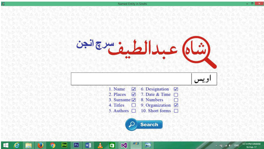
Fig. 2. Illustrates the Sindhi NER dashboard

Sindhi NER System shows the following extraction and it is connected to backend database. In this system user can search and mark the given below tags so our system will show their respective data Fig. 2 shows the dashboard of Sindhi NER System.