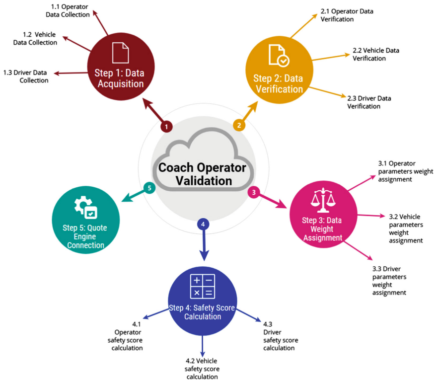
Fig. 3. Coach operator validator model process decomposition.

coach operator’s data relating to vehicles and drivers and produces a safety score for each journey. Weighting parameters are used, based on the UK government’s guidelines and regulations for coach operators [20–32] to determine the safety level. Figure 3 shows the process decomposition of the model for creation of the journey validator.