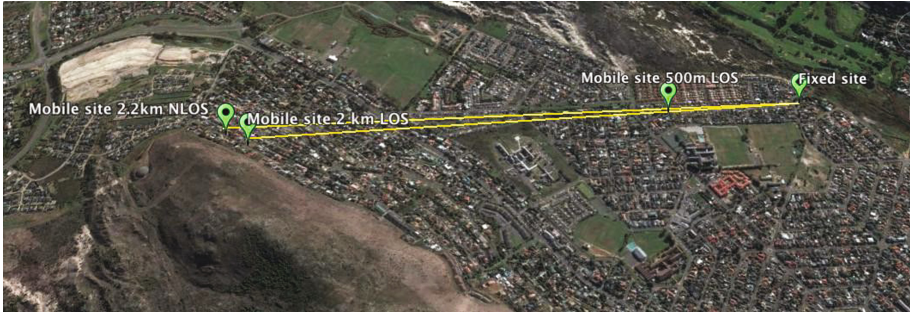
Fig. 3. Location of outdoor test sites in Fish Hoek, Cape Town