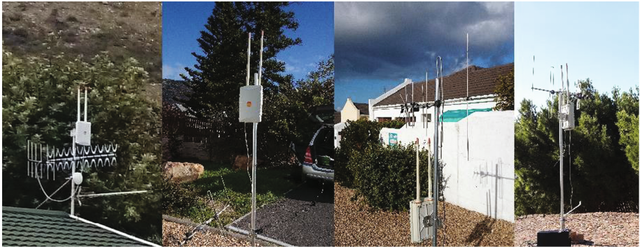
Fig. 2. Outdoor measurements setup: (a) Static installation on roof (b, c) Mobile installation 500 m up the road (d) Mobile installation 2.2 km away behind a tree

For outdoor measurements, one WSMN was statically mounted at the apex of the roof of a house in Fish Hoek, Cape Town (shown in Fig. 2(a)) and another WSMN was a mobile device powered by an uninterruptible power supply and placed at various points to test specific scenarios (shown in Fig. 2(b, c, d)) below.