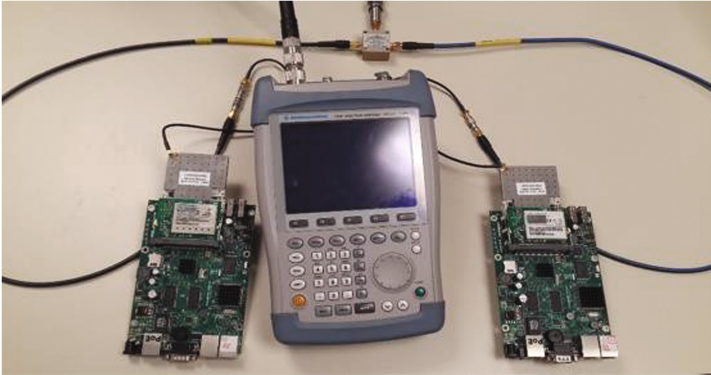
Fig. 1. Cabled measurement setup using 60 dB of attenuation and a splitter to check performance of devices without interference and with various levels of attenuation