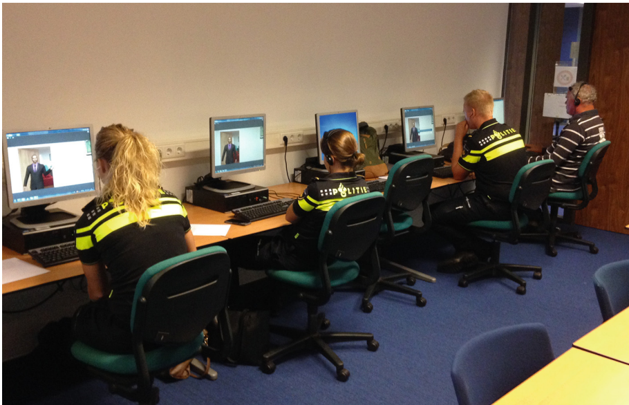
Fig. 2. Impression of the pilot experiment.

The pilot experiment was executed in a computer room at the Police Academy (see Fig. 2).