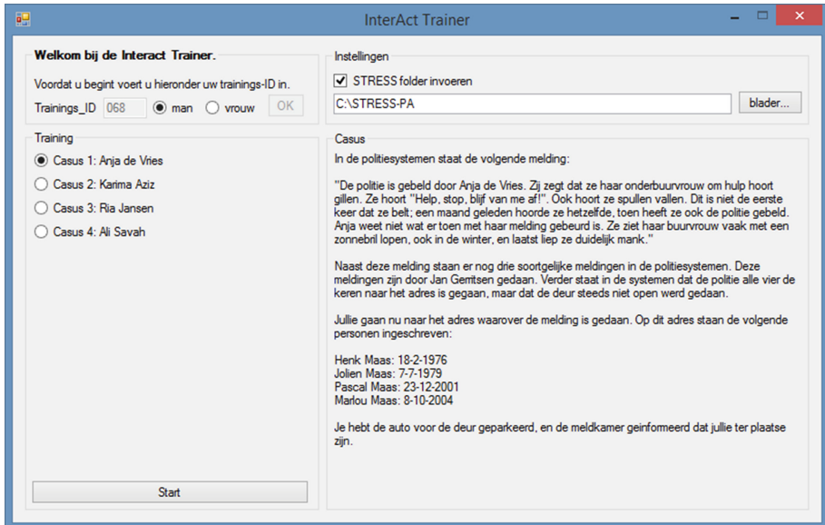
Fig. 3. Start menu of the training software (in Dutch).

Upon launching the software, the start menu shown in Fig. 3 was displayed. In the upper part of the menu, participants had to input their personal ID and gender. Below that, they could select the scenario they wanted to run. As mentioned, there were 4 training scenarios, which were chosen in such a way that they were representative for the types of situations encountered on the job.