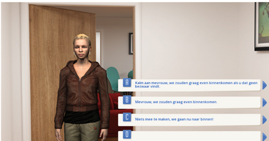
Fig. 1. Example screenshot of a training scenario.

To develop the training environment, the same approach as in [16] has been followed: the environment has been implemented in InterACT 2 , a training platform developed by the company IC3D Media. 3 The InterACT platform is especially suitable for designing simulation-based training of interpersonal skills, since it focuses on smaller situations, with high realism and detailed interactions with virtual characters. An example screenshot of a training scenario for students of the Police Academy is shown in Fig. 1.