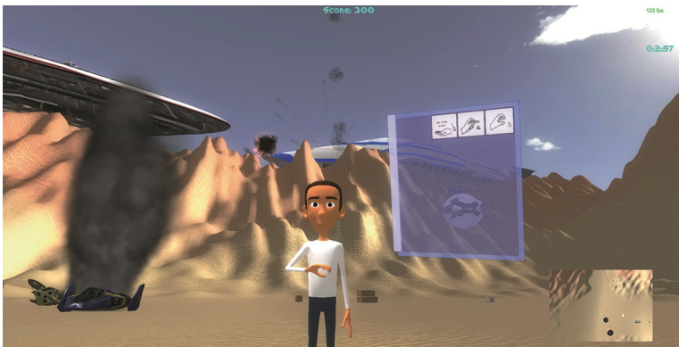
Fig. 1. Avatar in the first level, the score can be seen on the top, and on the corners there is the timer ( top ) and the minimap ( bottom ). The image also shows the inventory containing three gestures ( three square images with hand configurations ) and the avatar is performing the C sign.

The game starts by showing the user an interface explaining the basics of the game and introduces the story. The character is told by a friendly NPC that he must find someone and in order to do so he will need to collect all the gestures. Then after introducing his name the player can start his adventure in an open world scene. All the interactive items always give feedback and this feedback is always either hints for the player or a part of the story. The story has a relevant mysterious aspect to it. We tried to make sure that the story gives hints so that the player starts to realize what is happening in the virtual world but never being clear enough so that he loses interest in the story [6]. When the player acquires a sign that sign is added to his inventory, this inventory is where the user can access and see all his gestures at any time. The avatar is capable of