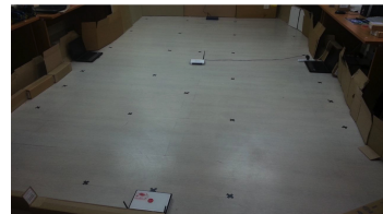
(b) Real scenario.

The Localization Algorithm is split in two phases: the 1) ASN implementation Phase and the 2) Approaching Phase, as shown in Fig. 5. During both phases, an underlying obstacle avoidance process, detailed in the next section, is running.