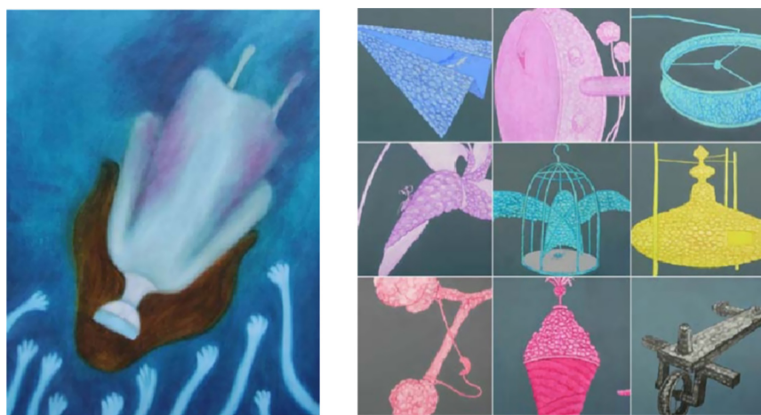
Fig. 4. "Call" oil painting

Computer games and animation in our life are the most interesting areas in multimedia. A large number of them are emerging to denounce our life, and promote many oil painting themes to be displayed in the form of cartoon animation. For example, I recently saw Liu Yimeng's work call (Fig. 4).