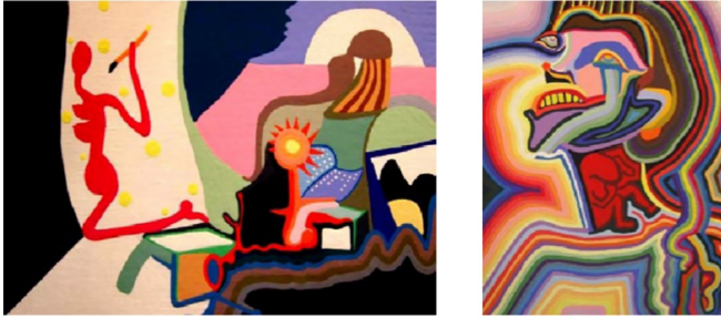
Fig. 3. Zhao Haibo's oil paintings

see that the painter uses the simplest point, line and surface to exaggerate the graphics, and uses flat painting and gradient in the bright colors. The intersection of pictures makes the picture form an order, an overall rhythm, and the picture is composed and the color is harmonious.