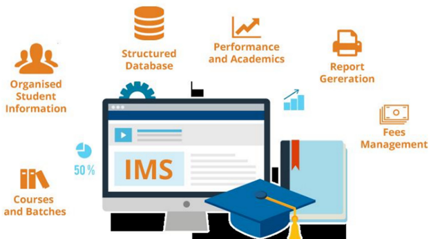
Fig. 1. Framework of education management system

Education management system should include the following aspects: curriculum management, student organization structure, database, cost management, as shown in Fig. 1.