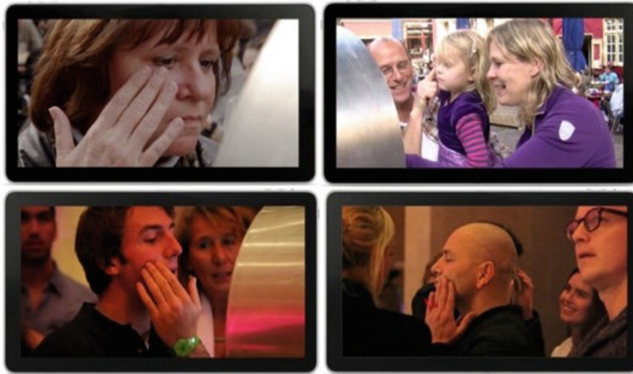
Fig. 1. Actors participating in the ASL caress their faces in Amsterdam and Utrecht

This paper describes and analyses two experiments in outdoor city public spaces to explore the effect of the interface design choices through research through design [17]. Two experiments explore the design choices, based on (1) observations (by a Host, see below) of participants’ actions and reactions; (2) thick descriptions of open ended interviews with participants; (3) photo and short video documentation that support these observations, when available (Fig. 1).