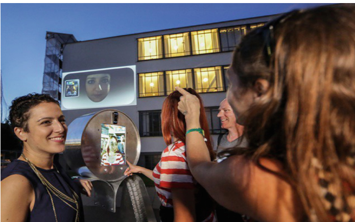
Fig. 4. Participants exploring in the Artistic Social Lab. Connecting Cities, 2015.

The ASL synthesis is activated by a Host, Actors and Spectators. Relations between caressing gestures, gesture tracing on screen and a resulting shared Virtual Persona, incite playful immersion for both Actors and Spectators. This immersion is established only when both screen and caressing gestures can be seen or experienced from one spatial position. The Hosting design creates conditions for all kinds of caressing and allows Actors to fully concentrate on this process. People experiment with acts and experiences of caressing, while expressing and sharing pleasure and joy. Even when acts of caressing result in merely 'losing touch with surrounding Spectators', Actors still need the witnessing presence of the Spectators' gazes around them, to experience their gestures as socially engaging. Moreover, the unpredictable results of merging portraits, becomes exciting only when witnessed and discussed by others. Co-creation of the Virtual Personae on screen seems to incite participation (Fig. 4).