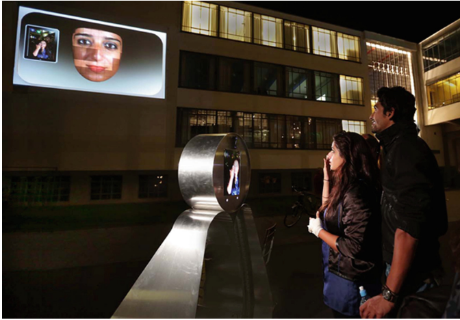
Fig. 5. Participants exploring in the Artistic Social Lab. Connecting Cities, 2015.

unfamiliarity with the visual-haptic experience of caressing-and-feeling-caressed intertwined with visually emerging on screen (Fig. 5).