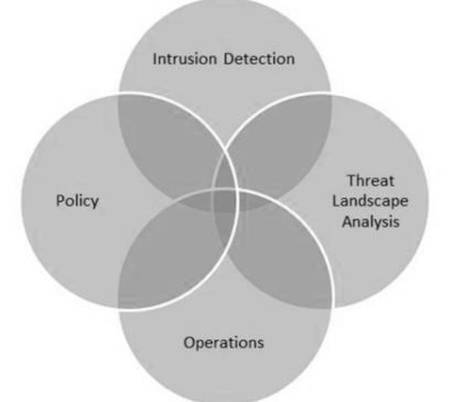
Figure 2 Domains of CDA

Our ethnographic and knowledge elicitation data revealed two findings that inform our on-going experimental work and prototype development. First, cyber-SA is distributed across both human operators and ICT artefacts in a complex socio-technical system spanning multiple operational domains. The domains we identified were intrusion detection, policy, operations or administration, and strategic analysis. Though an organization's cybersecurity posture is an aggregate of all these domains, operators often have limited awareness of the environmental state of other domains.